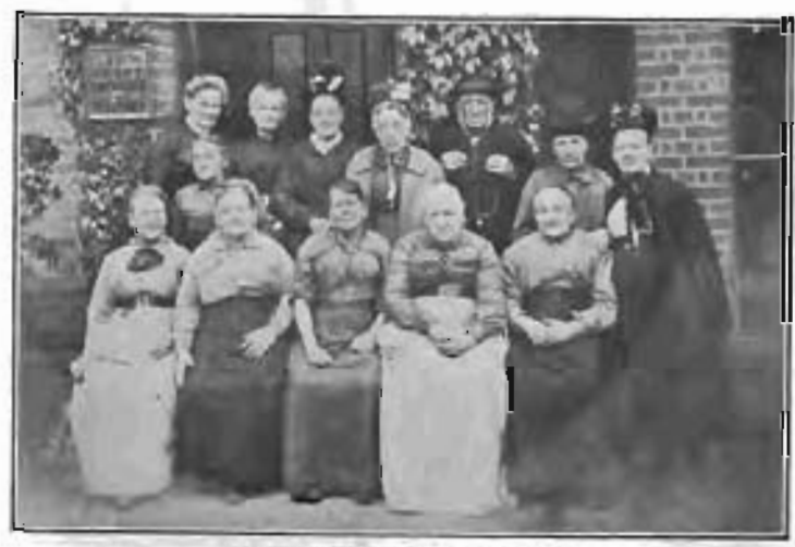
A Happy Group at Southend

bright and cheery, and there is always the hand-shake which means so much to them. Truly, I wonder as I visit them that