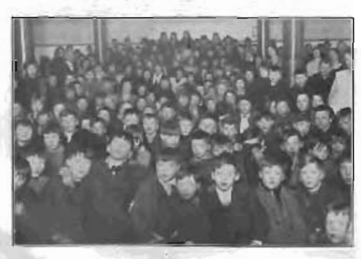
The Christmes Concert.

OTHER For the children there is the Sunday ACTIVITIES School. It is good to see them taking part in the Sunday morning service—when a child will tell a story, and four or five sing a chorus.