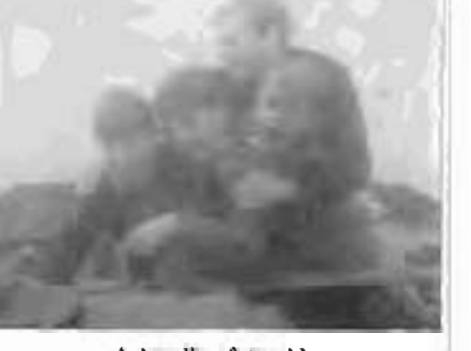
A bundle of trouble

ANYBODY who came into the Mission on Youth Club nights might be forgiven for thinking that bedlam had broken out. The silence of the place is shattered: the youngsters pour in - even on Guy Fawkes night when they said it was far safer inside than out with all the fire engines and police flying around. The gramophone peals out; games start;